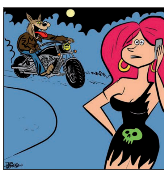
"I DON'T KNOW WHAT MY HALLOWEEN BLIND DATE LOOKS LIKE... ALL I KNOW IS HE'S A WILD MAN AND HE'LL BE HOWLING AT THE MOON ALL NIGHT!"