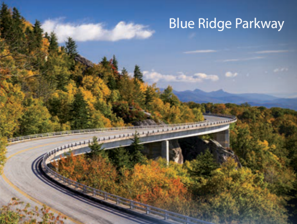
Blue Ridge Parkway

Hungry to open up your bike and go for a long summer scenic ride? Looking for beautiful visuals and loads of twists, turns, hills, and drops? Then check out these 5 great rides: