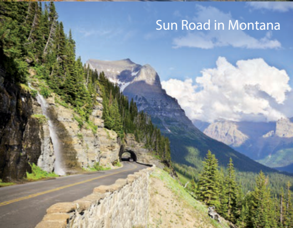
Sun Road in Montana